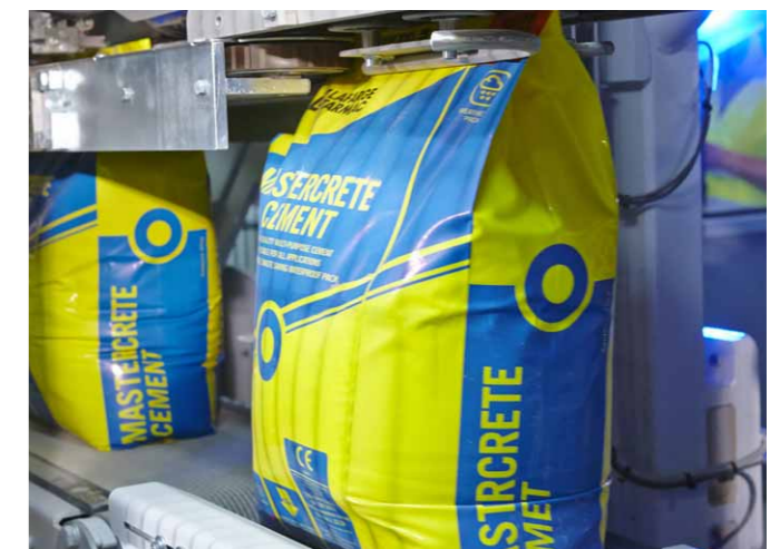
Filled bag before entering the closing station