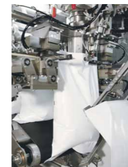
Bag at the filling spout

The INTEGRA® LIFFS® offers you a variety of convincing advantages: