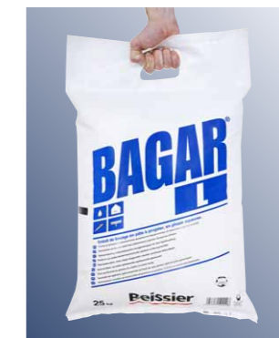
PE bag – with handle on request

HAVER & BOECKER INTEGRA® LIFFS® – the economically and ecologically perfect solution – from production to consumption.