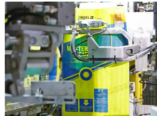
Bag handling and bag placer

HAVER & BOECKER ROTO-PACKER® 6-10 ADAMS® Edition – Cleanliness and efficiency from production to consumption.