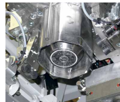
High speed filling spout