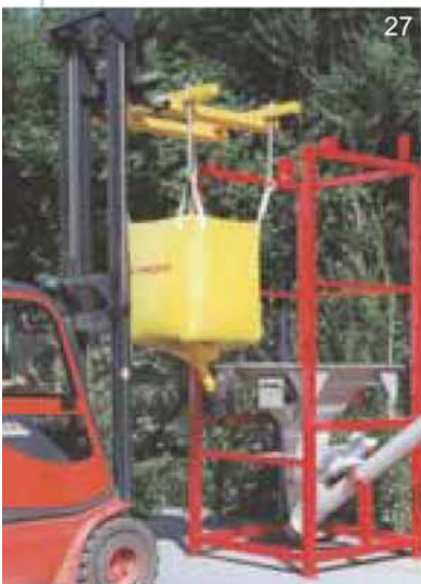
EMDE FIBC discharger with lifting device for the food industry