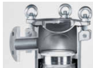
Compression bag hold down creates 360 degree sealing between filter bag and bag filter housing